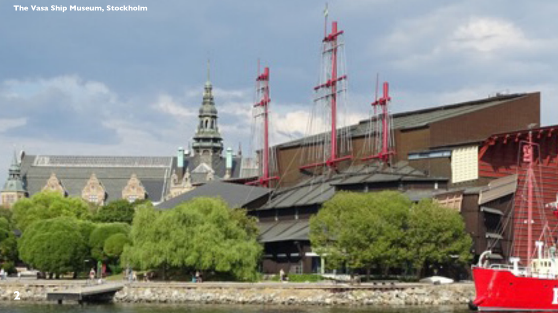
The Vasa Ship Museum, Stockholm

HEIRNET prides itself on being a friendly and supportive association. If you have any queries or concerns, do not hesitate to contact us at: heirnet@gmail.com