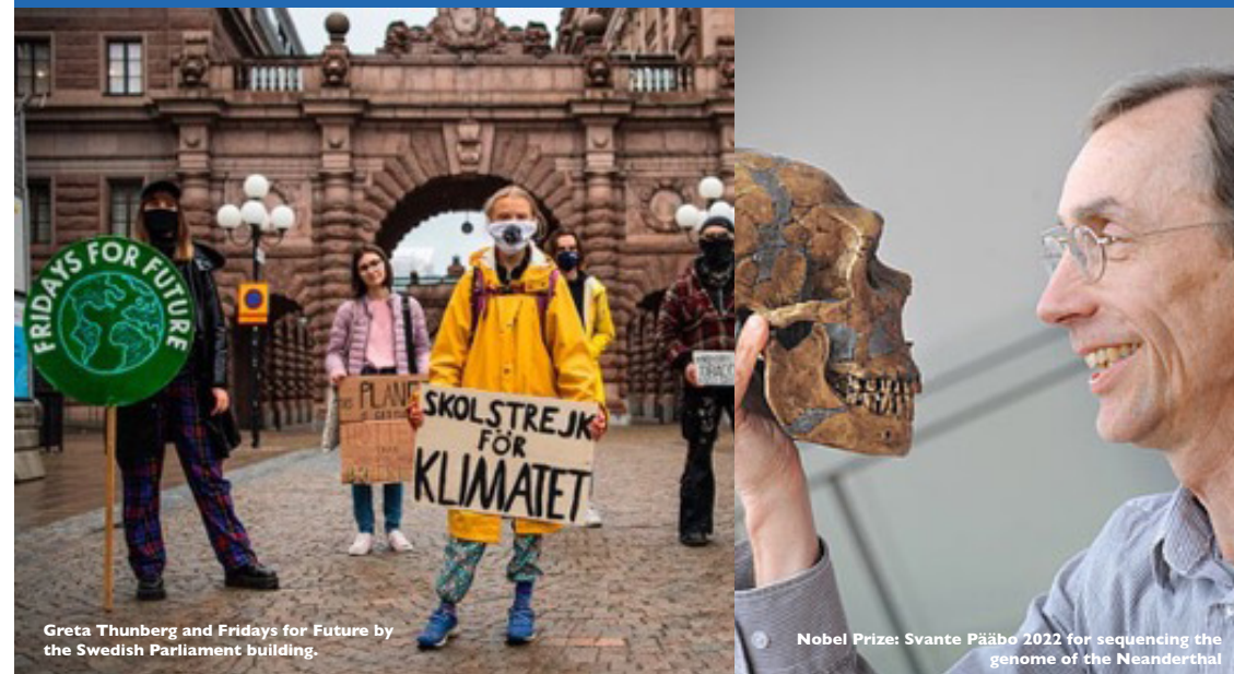
Greta Thunberg and Fridays for Future by the Swedish Parliament building.

History education can empower pupils and students with the historical perspective, knowledge, understanding and wisdom they need to live and thrive in these uncertain and perilous times with an uncertain future.