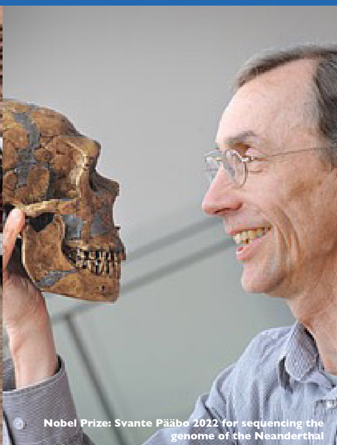
Nobel Prize: Svante Pääbo 2022 for sequencing the genome of the Neanderthal

HEIRNET is a friendly and supportive association. It brings together colleagues from around the world interested in History Education and its civilising, cultural, educational, social, political and citizenship roles.