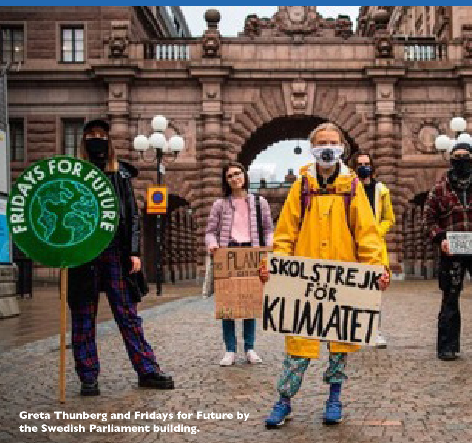
Greta Thunberg and Fridays for Future by the Swedish Parliament building.

History education can empower pupils and students with the historical perspective, knowledge, understanding and wisdom they need to live and thrive in these uncertain and perilous times with an uncertain future.