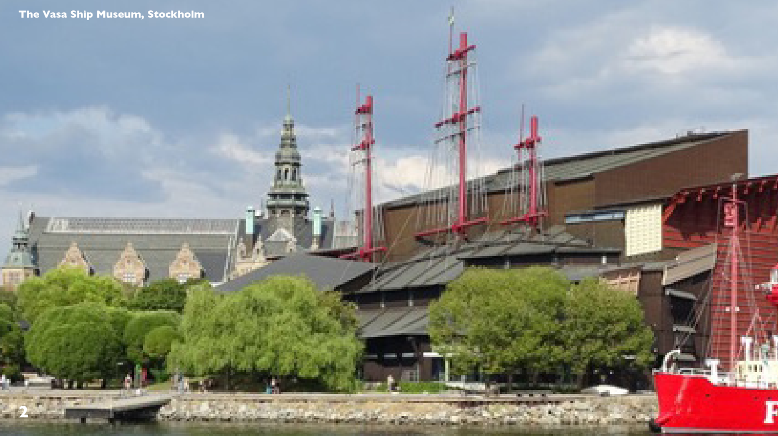
The Vasa Ship Museum, Stockholm

Dialogue & Discussion: the programme will build in time for extended discussion of presentations where possible.