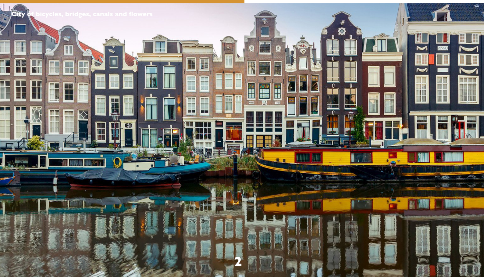
City of bicycles, bridges, canals and flowers

Dialogue & Discussion: the programme will build in time for extended discussion of presentations where possible.