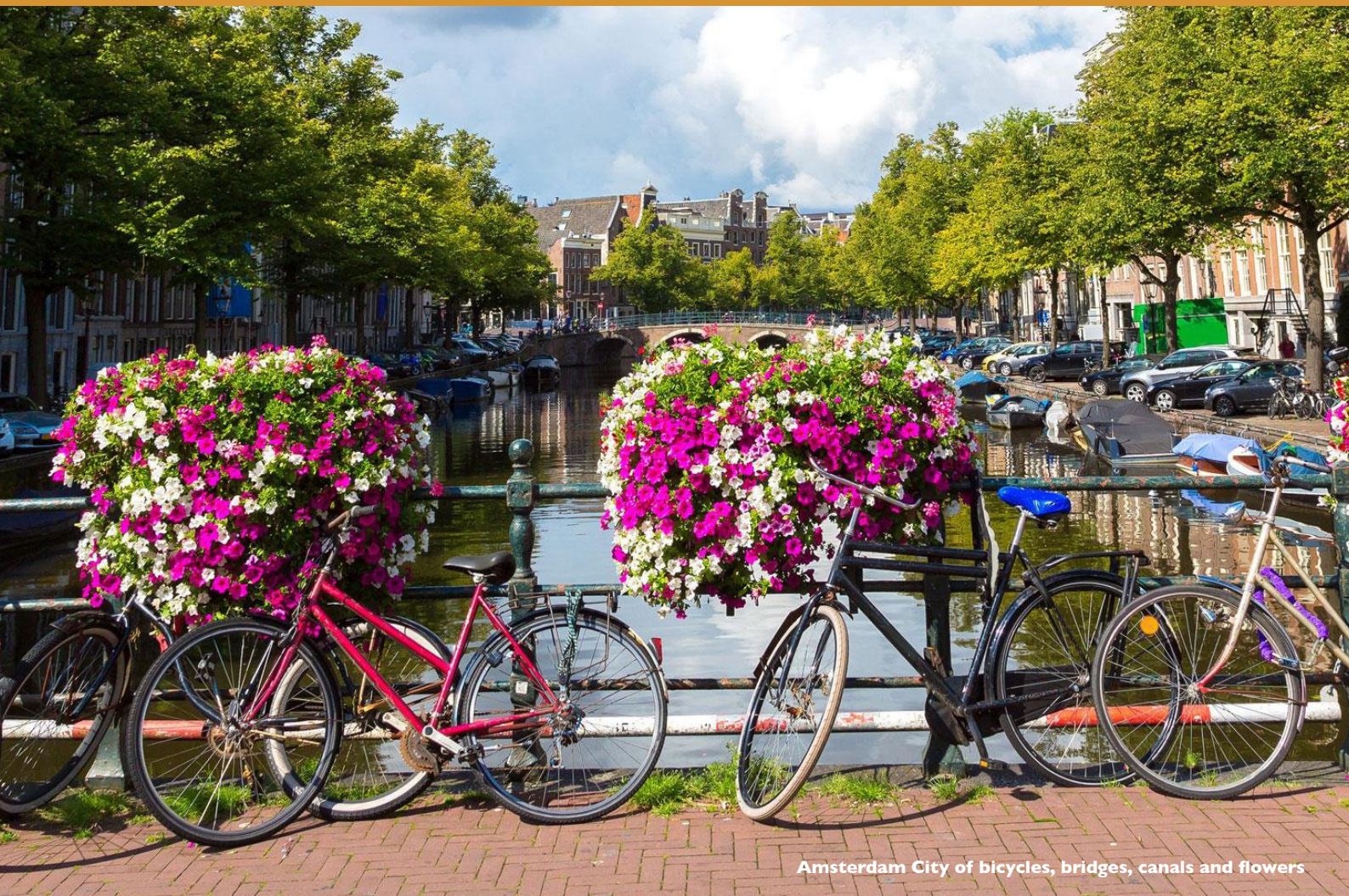
Amsterdam City of bicycles, bridges, canals and flowers

Connecting the past to the present and to the future makes history directly relevant to students during the historically rooted era of Covid-19 and Climate Change & Global Warming. Previously students tended to think that history is 'all dead and gone'. Now they can appreciate that the orientation that the past provides empowers them to make sense of the present and develop feasible expectations. Teaching how to connect the past to the present and to the future is a central concern of history education. Relevant history teaching from the primary to tertiary levels depends upon these powerful connections deeply rooted in the past.