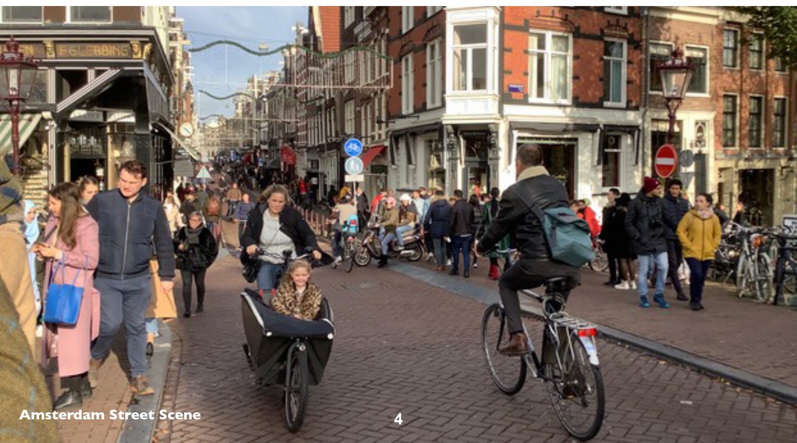
Amsterdam Street Scene