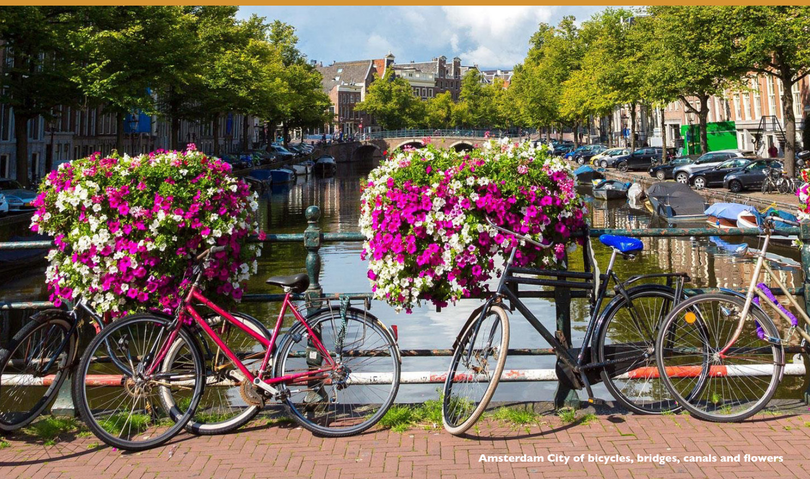
Amsterdam City of bicycles, bridges, canals and flowers

Connecting the past to the present and to the future makes history relevant to students. This can be a difficult task, because they usually tend to think that history is 'all dead and gone'. Students often fail to see that the only way to make sense of the present and to develop feasible expectations for the future is provided by orientation on the past. Teaching how to connect the past to the present and to the future should therefore be a central concern of history teachers. Relevant history teaching cannot do without these connections rooted in the past.