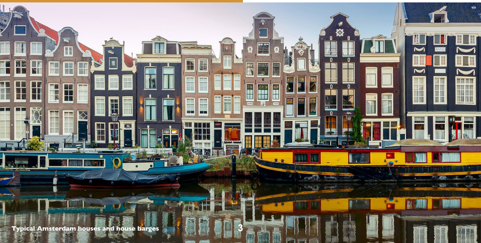
Typical Amsterdam houses and house barges

Dialogue & Discussion: the programme will build in time for extended discussion of presentations where possible.